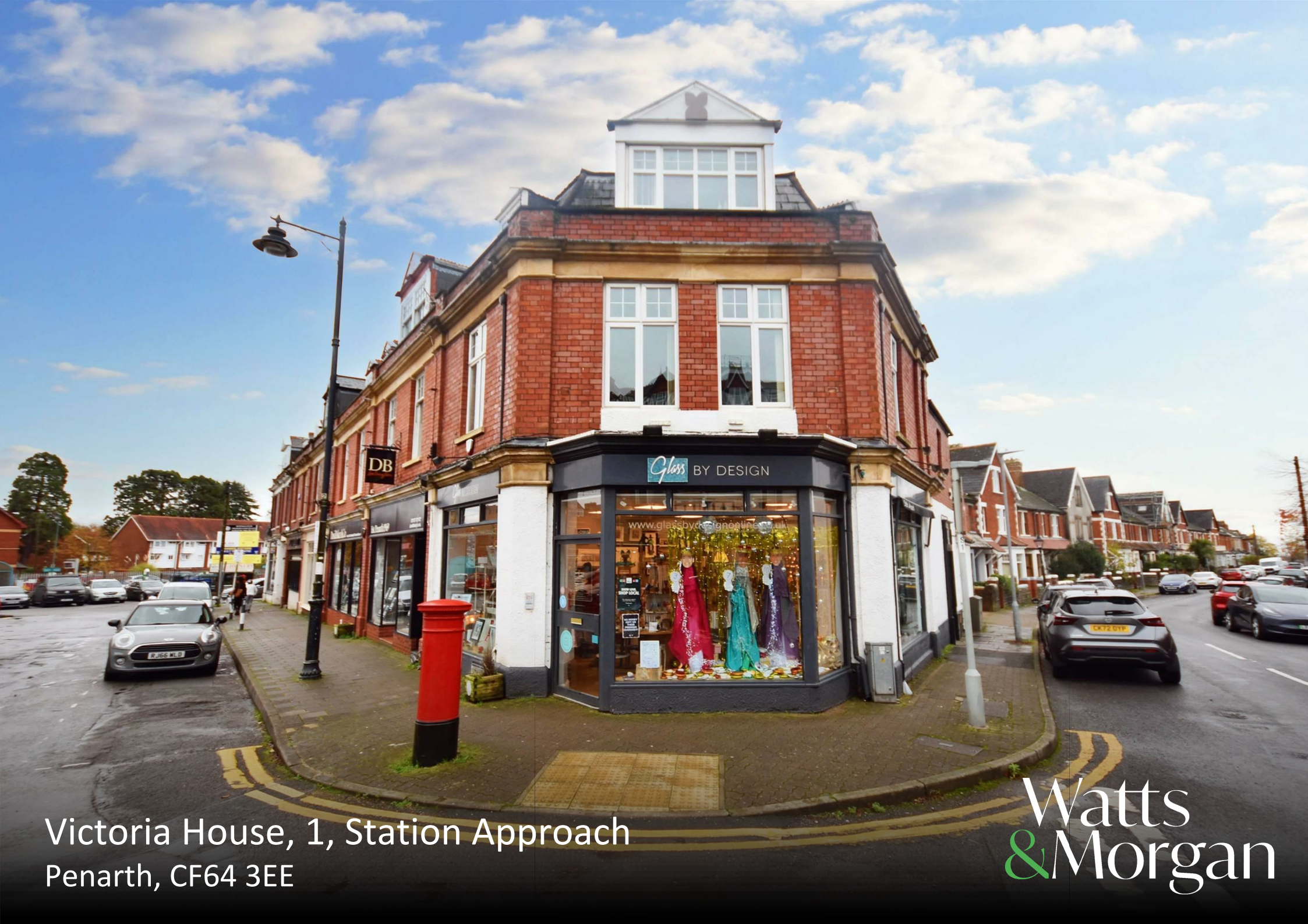
Victoria House, 1, Station Approach Penarth, CF64 3EE